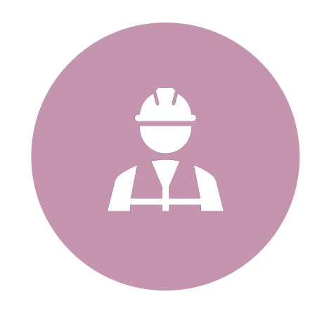
DIVISION OF LABOR