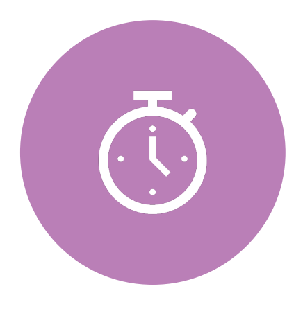
YOU HAVE 5 MINUTES TO FINISH.